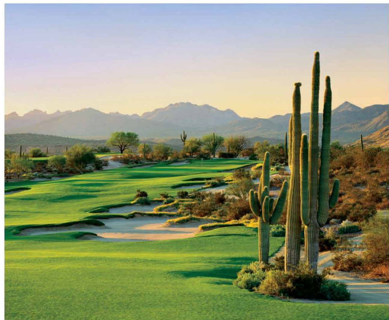
The closing hole at We-Ko-Pa's Saguaro Course, which debuts at No. 44.